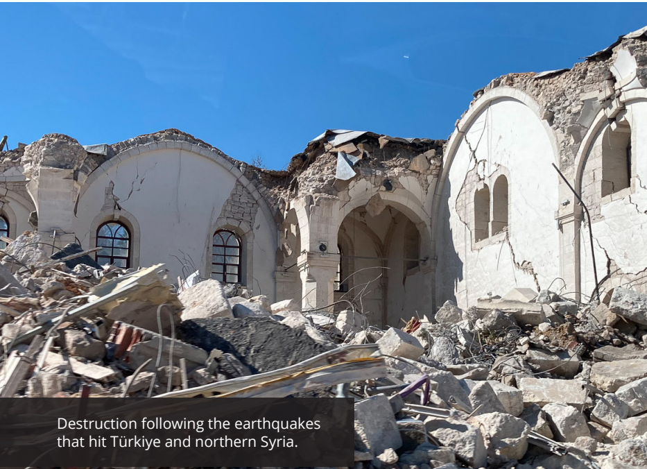
Destruction following the earthquakes that hit Türkiye and northern Syria.

On February 6, 2023, two earthquakes measuring 7.7 and 7.6 on the Richter Scale struck Türkiye and northern Syria, followed by thousands of aftershocks. Two weeks later, another powerful earthquake struck southern Türkiye. Millions were affected, and over 50,000 people tragically lost their lives.