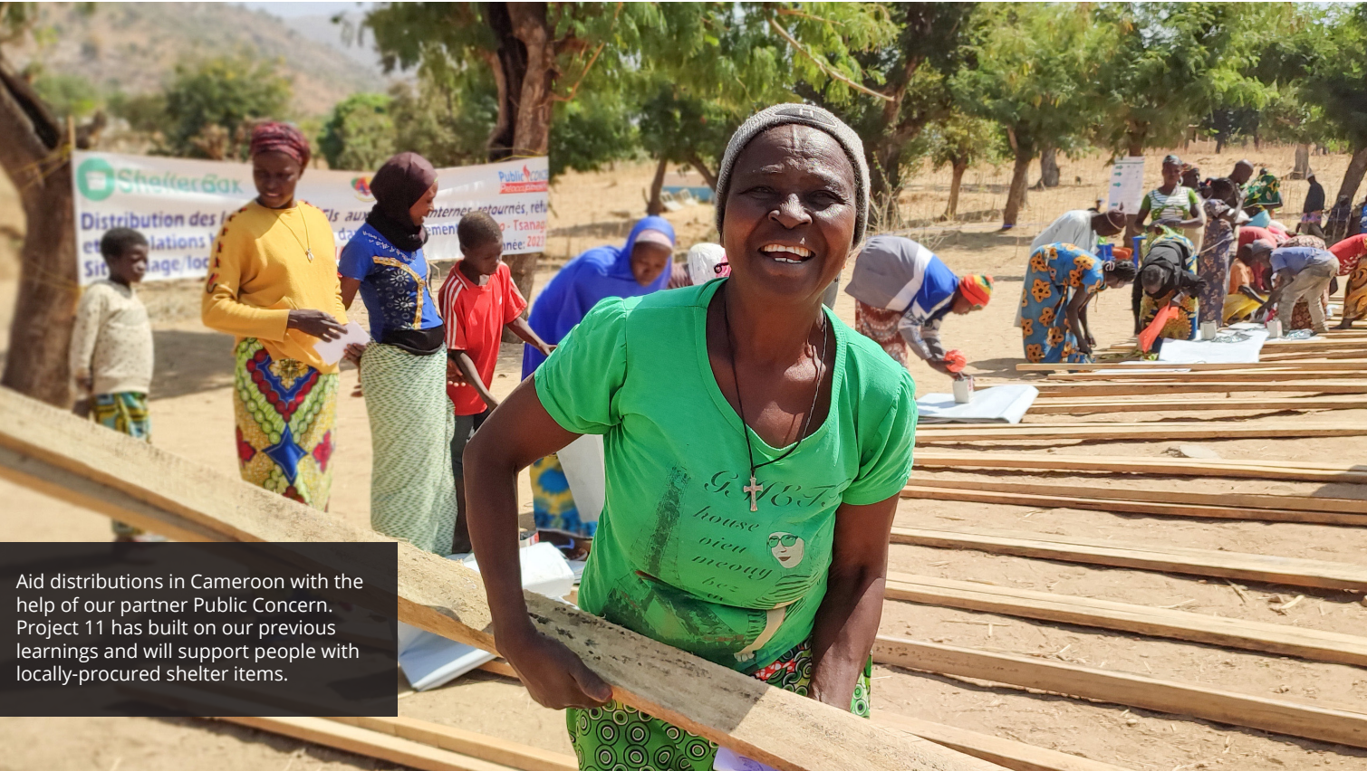
Aid distributions in Cameroon with the help of our partner Public Concern. Project 11 has built on our previous learnings and will support people with locally-procured shelter items.

Learn about how we are adapting to meet the growing need around the world