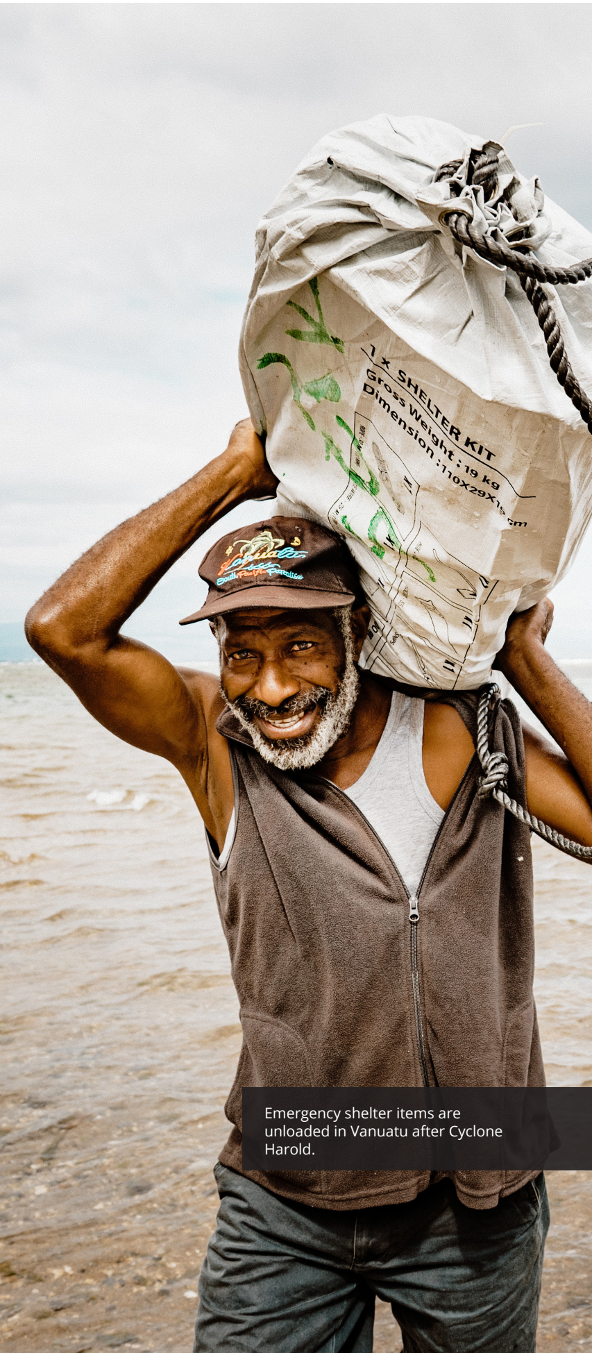
Emergency shelter items are unloaded in Vanuatu after Cyclone Harold.

Recovery doesn’t happen overnight, but a dry and warm place to sleep, prepare meals and be with your family is the vital first step.