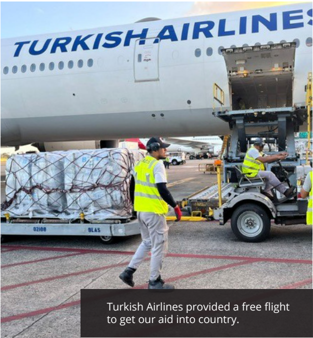
Turkish Airlines provided a free flight to get our aid into country.

Thanks to your support, we were able to reach vulnerable families with vital aid to protect them from the winter weather, prevent the spread of disease, and provide some privacy as they began to rebuild their lives.