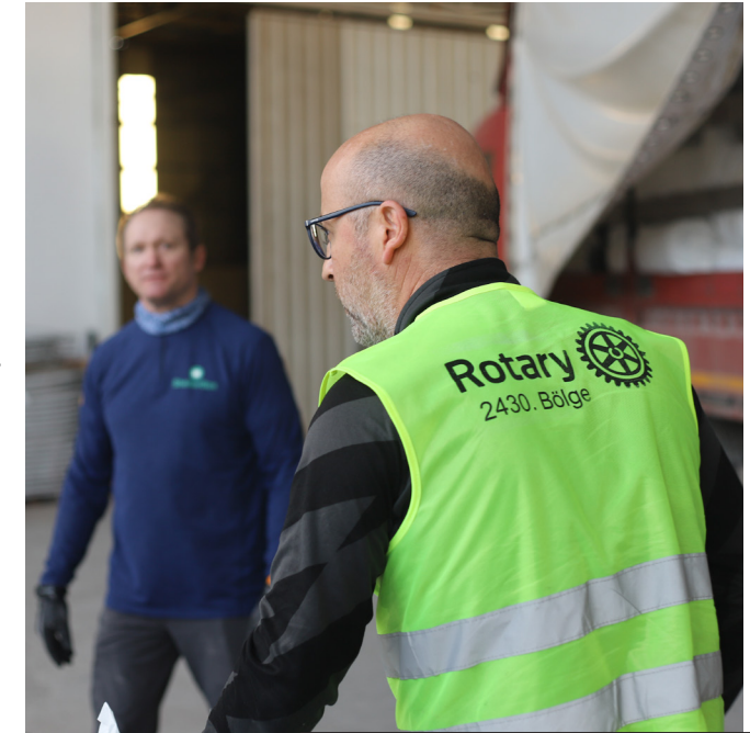
Rotary helps with distributions in Türkiye following the earthquakes.

There are so many ways Rotarians support families who have lost everything, from raising awareness and funds at home to providing a valuable point of contact for Response Teams through first-hand knowledge, introductions, logistical assistance, and vital links into communities.